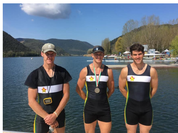
Team Zimbabwe Rowing in Piedillico, Italy